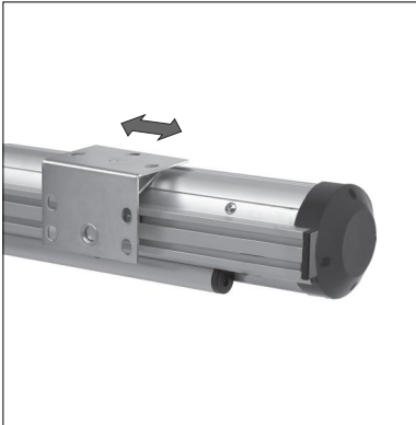
VMS - mounting system - easy and comfortable installation