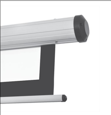
Black border around the screen surface