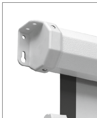
Integrated suspension points on the right and left side