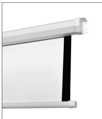
Black stripes on sides of the screen surface