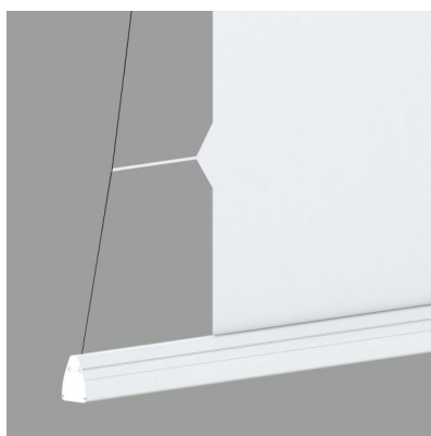
Special tensioning system on the both sides of screen for perfect flatness of projection surface