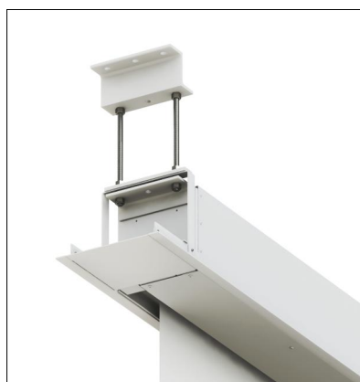
Mounting set for installation is included in delivery