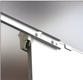
Foldable bars for additional paper on both sides of flipchart