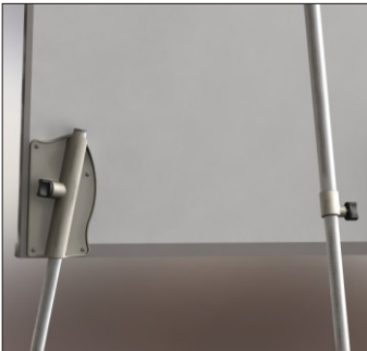
Height adjustable of flipchart is possible from rear side