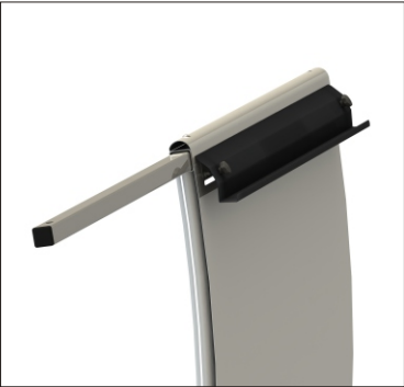
Detail of upper steel clap-ledge