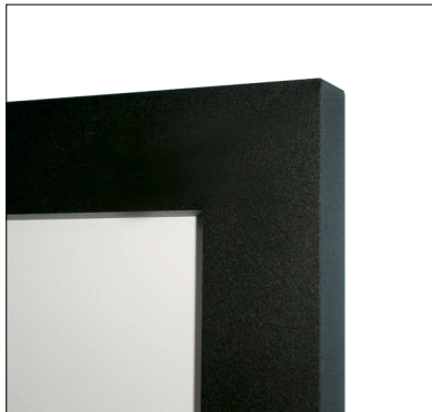
Aluminium frame - 3 cm depth, black varnished