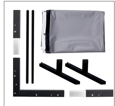
The frame system consists of separate aluminium segments