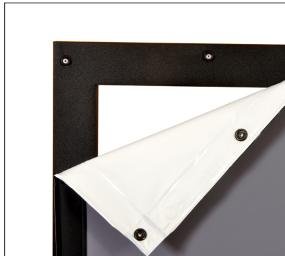
Tensioning of the screen surface by press studs on the reverse of the frame