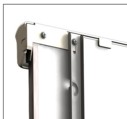
Detail of upper clap-ledge