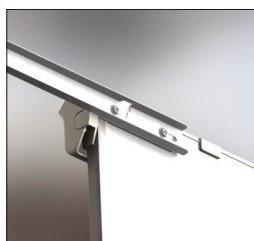
Foldable bars for additional paper